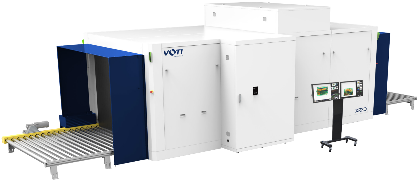
AS SHOWN: WITH OPTIONAL ROLLER TABLES AND MONITOR STAND IMAGES ARE SUBJECT TO CHANGE